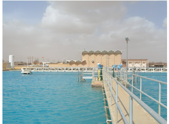
The Osage Water Treatment plant has a daily treatment capacity of 70 million gallons, and 15 million gallons of groundwater storage.

TCEQ completed an assessment of your source water, and results indicate that some of our sources are susceptible to certain contaminants. The sampling requirements for your water system is based on this susceptibility and previous sample data. Any detections of these contaminants will be found in this Consumer Confidence Report. For more information on source water assessments and protection efforts at our system contact Ben Orr at 806-673-5357.