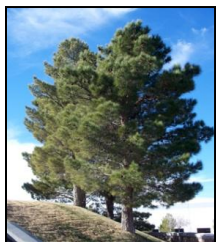
Mondell Pine ( Pinus eldarica ): Hardiness Zone 6-9, fast growth, evergreen, drought tolerant, alkaline soil, 50 ft tall, 30 ft spread, full sun