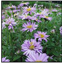
Monch Aster (Frikartii aster):

Hardiness Zone 5-9, perennial, low/medium watering, well-drained soil, 1-3 ft tall, 1-3 ft spread, full/part sun mature plants may cover up to 7 sq ft per plant