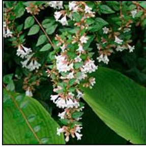
Glossy Abelia (Abelia):

Hardiness Zone 6-9, shrub, low water, fertile, well-drained soil, 10 ft tall, 12 ft spread, full/part sun mature plants may cover up to 113 sq ft per plant