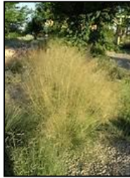
Alkali Sacaton ( Sporobolus airoides ): Hardiness Zone 6-9, alkaline heavy clay soils, drought tolerant, low water, 3-4 ft tall, 2-3 ft spread, full/part sun mature plants may cover up to 7 sq ft per plant