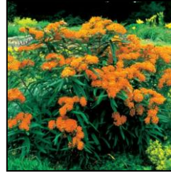
Butterfly Weed (Asclepias

(Buddleia davidii): Hardiness Zone 5-9, perennial, moderate watering, 3-6 ft tall, 4 ft spread, full sun mature plants may cover up to 12 sq ft per plant