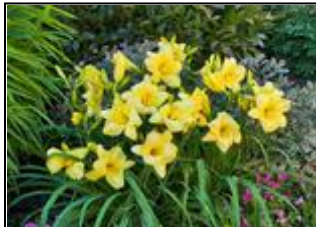
Daylily ( Hemerocallis ): Hardiness Zone 3-10, perennial, low water, average soil, 1-3 ft tall, 1-2 ft spread, full/part sun mature plants may cover up to 3 sq ft per plant