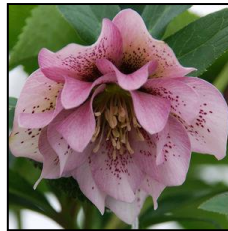
Lenten Rose (Helleborus

armerioides): Hardiness Zone 4-7, perennial, low water, 3-4 in tall, 1-2 ft spread, full/part sun mature plants may cover up to 3 sq ft per plant