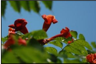
Trumpet Vine (Campsis

(Chrysothamnus): Hardiness Zone 4-9, shrub, drought tolerant, low water, average well-drained soil, 2 ft tall, 2 ft spread, full/part sun mature plants may cover up to 3 sq ft per plant