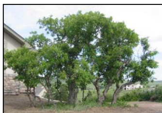
Gambel Oak ( Quercus gambelii ):

( Pyrus calleryana ): Hardiness Zone 4-8, fast growth rate, moderate watering, heat resistant, grows in most soil types, 30ft tall, 30 ft spread, full sun