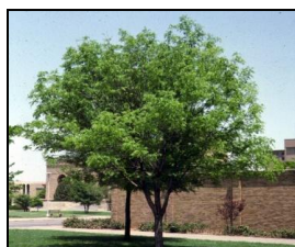
Chinese Pistache ( Pistacia chinensis )

Hardiness Zone 3-9, moderate growth rate, spreads by underground stems, adapted to dry, rocky, alkaline sites, drought tolerant, 20-30 ft tall, 15 ft spread, full sun