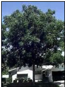
Kentucky Coffeetree ( Gymnocladus dioica ): Hardiness Zone 3-8, slow/medium growth, drought tolerant, most soil types, 60-75 ft tall, 40-50 ft spread, full sun