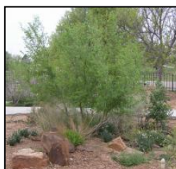
New Mexican Privet

linearis ): Hardiness Zone 6-9, medium growth, extremely drought tolerant, cannot grow in wet or heavy soil, 15-25 ft tall, 10 ft spread, full sun