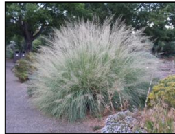
Giant Sacaton ( Sporobolus wrightii ): Hardiness Zone 5-8, Grass, drought tolerant, low water, average soil, 6 ft tall, 4 ft spread, full sun mature plants may cover up to 12 sq ft per plant