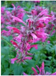
Red Hyssop ( Agastache ):

Hardiness Zone 5-9, perennial, drought tolerant, humus-rich well-drained soil, 3-5 ft tall, 1-2 ft spread, full/part sun mature plants may cover up to 3 sq ft per plant