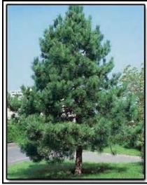
Austrian Pine ( Pinus nigra ):

Hardiness Zone 4-7, medium growth rate, evergreen, heat/drought tolerant, alkaline soil, 60 ft tall, 20-40 ft spread, full sun