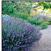
Lavender (Lavandula): Hardiness

Garden Phlox (Phlox): Hardiness Zone 4-8, perennial, moderate watering, moderately fertile, 3-6 in tall, 1 ft spread, full/part sun mature plants may cover up to 1 sq ft per plant