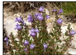
Smoky Hills Prairie Skullcap

( Oenothera macrocarpa ): Hardiness Zone 4-9, perennial, drought tolerant, low water, loamy soil, 4 in tall, 1 ft spread, full sun mature plants may cover up to 1 sq ft per plant