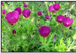
Wine Cups ( Callirhoe

( Centranthus ruber ): Hardiness Zone 5-8, perennial, drought tolerant, low watering, alkaline soil, 1-3 ft tall, 1-3 ft spread, full sun mature plants may cover up to 7 sq ft per plant