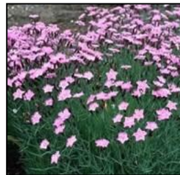
Cheddar Pink (Dianthus):

Hardiness Zone 3-9, perennial, low water usage, average, well-drained soil, 4-36 in tall, 1-2 ft spread, full/part sun mature plants may cover up to 3 sq ft per plant