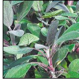
Desert Purple Sage ( Salvia dorrii ): Hardiness zone 5-9, perennial, low/medium water, well-drained alkaline soil, 1-3 ft tall, 1-3 ft spread, full sun mature plants may cover up to 7 sq ft per plant