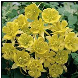
Yellow Columbine ( Aquilegia

Hardiness Zone 3-9, perennial, drought tolerant, well-drained soil, 1-3 ft tall, 1-3 ft spread, full sun mature plants may cover up to 7 sq ft per plant