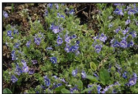
Blue Woolly Speedwell

Hardiness Zone 5-8, annual/perennial, drought tolerant, moderate watering, 1-2 ft tall, 2 ft spread, full/part sun mature plants may cover up to 3 sq ft per plant