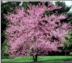
Texas Redbud (Cercis texensis)

(Crataegus): Hardiness Zone 4-8, medium growth rate, most soil types, 25-30 ft tall, 25 ft spread, full sun