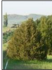
Rocky Mountain Juniper ( Juniperus scopulorum ): Hardiness Zone 4-9, slow growth rate, tolerates drought, needs well drained soil, 30-40 ft tall, 10-15 ft spread, full sun