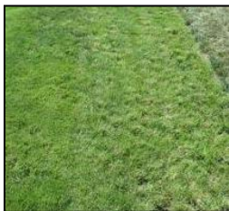
Blue Grama Grass ( Bouteloua gracilis ): Hardiness Zone 3-9, warm season grass, most soil types, drought tolerant, low water, full sun