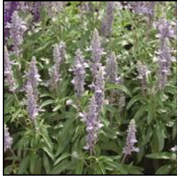
May night salvia (Salvia):

Hardiness Zone 5-9, perennial, low/medium watering, well-drained soil, 1-3 ft tall, 1-3 ft spread, full/part sun mature plants may cover up to 7 sq ft per plant