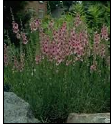
Coral Canyon Twinspur ( Diascia integerrima ): Hardiness Zone 5-9, perennial, moderate watering, 12-15 in tall, 15-18 in spread, full/part sun mature plants may cover up to 2 sq ft per plant