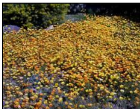
Desert Marigold ( Baileya multiradiata ): Hardiness Zone 6-9, annual/perennial, low water, well-drained soil, 1 ft tall, 1 ft spread, full sun mature plants may cover up to 1 sq ft per plant