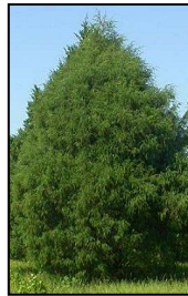
Eastern Red Cedar ( Juniperus virginiana ):

Hardiness Zone 2-7, slow/medium growth rate, tolerates drought, most soil types, 50-75 ft tall, 10-20 ft spread, full sun