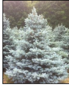
Colorado Blue Spruce ( Picea pungens ):

Hardiness Zone 6-9, medium growth, drought tolerant once established, various soil, 50-70 ft tall, 40-60 ft spread, full sun