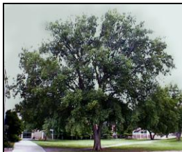
Lacebark Elm ( Ulmus parvifolia ): Hardiness Zone 5-9, medium/fast growth, tolerates drought, very durable tree, 40-50 ft tall, 35-45 ft spread, full sun