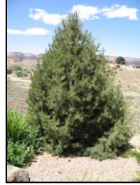
Pinyon pine ( Pinus cembroides ): Hardiness Zone 6-8, slow growth, evergreen, tolerates drought, needs well-drained soil, low water, 25-50 ft tall, 20-40 ft spread, full sun