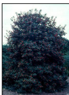
Nellie Stevens Holly ( Ilex ):

(male only): Hardiness Zone 6-9, medium growth, various well-drained soils, withstands heat and drought, 25-35 ft tall, 25-35 ft spread, full sun