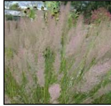
Diamond Grass ( Calamagrostis brachytricha ): Hardiness Zone 4-10, low water, average soil, 4 ft tall, 18-24 in spread, full/part sun mature plants may cover up to 3 sq ft per plant