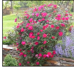
Knock Out® Rose (Rosa radrazz):

Hardiness Zone 6-9, shrub, low water, fertile, well-drained soil, 10 ft tall, 12 ft spread, full/part sun mature plants may cover up to 113 sq ft per plant