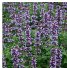
Blue Fortune Hyssop

Riding Hood Hot Pink): Hardiness Zone 5-8, perennial, grows best in dry average soil, 18-24 in tall, 18 in spread, full sun mature plants may cover up to 2 sq ft per plant