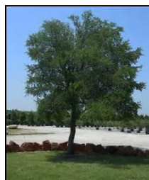
Cedar Elm ( Ulmus crassifolia ):

Hardiness Zone 3-8, slow growth rate, resistant to heat stress, long-lived tree, moderate water, 70-80 ft tall, 80 ft spread, full sun