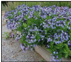
Blue Star (Amsonia blue ice):

(Eupatorium): Hardiness Zone 6-9, perennial, drought/heat tolerant, well-drained soil, 1-3 ft tall, 2-3 ft spread, full/part sun mature plants may cover up to 7 sq ft per plant