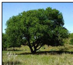
Netleaf Hackberry ( Celtis

tashkentensis ): Hardiness Zone 6-9, fast growth rate, flowers throughout the summer months, drought/heat tolerant, 30 ft tall, 30 ft spread, full/part sun