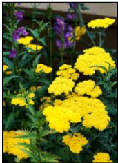
Yarrow ( Achillea millefolium ):

involucrate ): Hardiness Zone 3-9, perennial groundcover, drought tolerant, loamy soil, 6 in tall, 30 in spread, full/part sun mature plants may cover up to 5 sq ft per plant