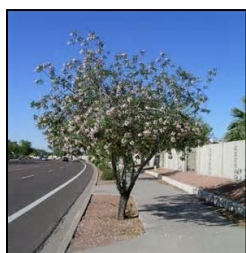
Chitalpa ( Chitalpa

Hardiness Zone 6-9, moderate growth rate, well-drained slightly acidic soil, moderate water, 30 ft tall, 15 ft spread, full/part sun