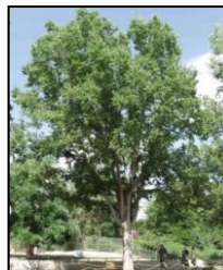
Hackberry ( Celtis occidentalis ):

( Koelreuteria paniculata ): Hardiness Zone 5-9, medium/fast growth, 30-40 ft tall, 35 ft spread, various soil conditions, full sun