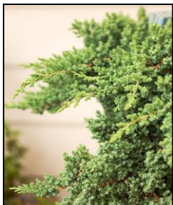
Juniper (Juniperus communis):

(Philadelphus): Hardiness Zone 4-7, extremely drought tolerant, well-drained soil, 3-15 ft tall, 6 ft spread, full/part sun mature plants may cover up to 28 sq ft per plant