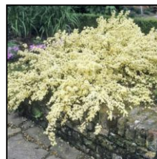
Pineapple Broom (Cytisus kewensis):

Hardiness Zone 3-9, shrub, low/moderate water, drought tolerant, up to 60 ft tall, up to 20 ft spread, full/part sun mature plants may cover up to 314 sq ft per plant