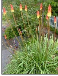
Red Hot Poker ( Kniphofia uvaria ):

Hardiness Zone 5-9, perennial, drought tolerant, humus-rich well-drained soil, 3-5 ft tall, 1-2 ft spread, full/part sun mature plants may cover up to 3 sq ft per plant