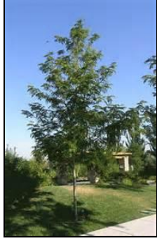
Honeylocust ( Gleditsia triacanthos ): Hardiness Zone 3-9, fast growth rate, withstands drought and poor soil conditions, 30-70 ft tall, 30-70 ft spread, full sun