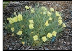
Silver Blade Evening Primrose

Hardiness Zone 4-9, perennial, drought tolerant, well-drained soil, 3-5 ft tall, 3 ft spread, full sun mature plants may cover up to 7 sq ft per plant