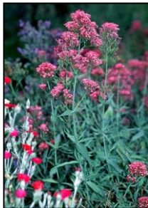
Red Valerian ( Centranthus ruber ):

Hardiness Zone 4-11, perennial, low water, well-drained soil, 3-6 ft tall, 1-3 ft spread, full sun mature plants may cover up to 7 sq ft per plant