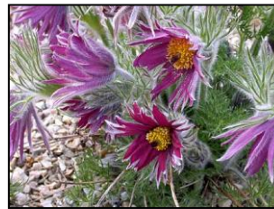
European Pasque Flower ( Pulsatilla vulgaris ): Hardiness Zone 5-8, perennial, low water, well-drained sandy loam soil, 12-15 in tall, full/part sun mature plants may cover up to 1 sq ft per plant