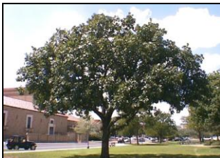
Bur Oak ( Quercus macrocarpa ):

Hardiness Zone 5-10, medium growth rate, heat tolerant, acidic soil, medium water requirement, 50-70 ft tall, 20-30 ft spread, full/part sun