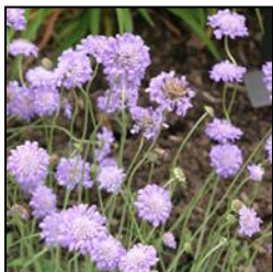
Pincushion flower (Scabiosa):

Hardiness Zone 3-9, perennial, low water, loam soil, 1 ft tall, 1-2 ft spread, full/part sun mature plants may cover up to 3 sq ft per plant