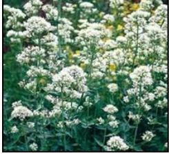
White Jupiters Beard

( Centranthus ruber ): Hardiness Zone 5-8, perennial, drought tolerant, low watering, alkaline soil, 1-3 ft tall, 1-3 ft spread, full sun mature plants may cover up to 7 sq ft per plant