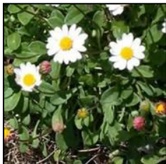
Grassleaf Mat Daisy (Hirpicium

Zone 5-9, perennial, drought/heat/wind tolerant, well-drained soil, 1-3 ft tall, 1-3 ft spread, full sun mature plants may cover up to 7 sq ft per plant