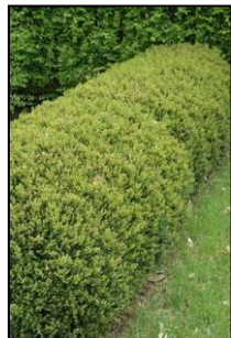
Winter Gem Boxwood (Buxus

grandiflora): Hardiness Zone 4-9, grow with trellis or fence away from buildings and trees, requires regular pruning, low water, nearly any soil condition, 30-40 ft tall, 10 ft spread, full/part sun mature plants may cover up to 78 sq ft per plant