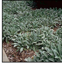
Lambs Ear (Stachys byzantina):

(Tetranneuris): Hardiness Zone 5-8, perennial, drought tolerant, 10-14 in tall, 12-18 in spread, full/part sun mature plants may cover up to 2 sq ft per plant