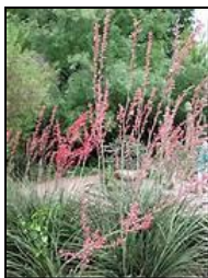
Red Yucca ( Hesperaloe parviflora ):

Hardiness Zone 5-8, perennial, drought tolerant, prefers alkaline soils, 1-3 ft tall, 1-3 ft spread, full sun mature plants may cover up to 7 sq ft per plant