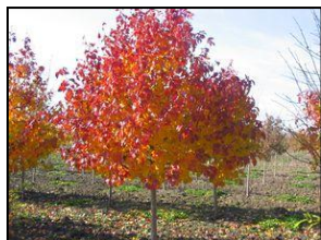
Aristocrat Pear Tree

( Pyrus calleryana ): Hardiness Zone 4-8, fast growth rate, moderate watering, heat resistant, grows in most soil types, 30ft tall, 30 ft spread, full sun