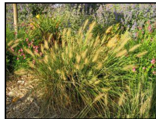
Hameln Dwarf Fountain Grass ( Pennisetum alopecuroides ): Hardiness Zone 5-8, moderate watering, 1-2 ft tall, 2 ft spread, full sun mature plants may cover up to 3 sq ft per plant