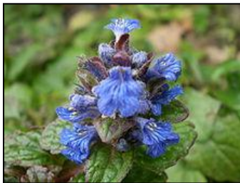
Ajuga (Ajuga reptans):

Hardiness Zone 4-10, perennial, moderate water, groundcover, 4-9 in tall, 6-18 in spread, full/part sun & shade mature plants may cover up to 2 sq ft per plant