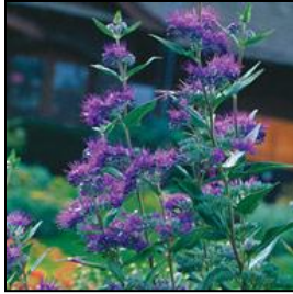
Blue Mist Flower

(Eupatorium): Hardiness Zone 6-9, perennial, drought/heat tolerant, well-drained soil, 1-3 ft tall, 2-3 ft spread, full/part sun mature plants may cover up to 7 sq ft per plant