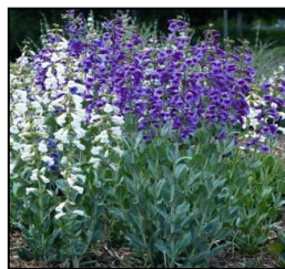
Prairie Jewel (Penstemon

involucrate ): Hardiness Zone 4-8, perennial, drought tolerant, average soil, up to 3 ft tall, 1-3 ft spread, full sun mature plants may cover up to 7 sq ft per plant