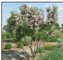
Desert Willow ( Chilopsis

Reticulata ): Hardiness Zone 5-8, medium growth rate, various soil types, heat/drought tolerant, 30 ft tall, 35 ft spread, full sun