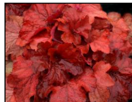
Fire Alarm Coralbells ( Heuchera ): Hardiness Zone 4-9, perennial, drought & heat tolerant, well-drained soil, 1 ft tall, 2 ft spread, shade/part shade mature plants may cover up to 3 sq ft per plant