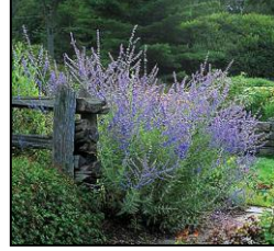
Russian Sage ( Perovskia ):

Hardiness Zone 6-11, thornless perennial, low water, drought tolerant, well-drained soil, 1-3 ft tall, 3-6 ft spread, full sun mature plants may cover up to 28 sq ft per plant