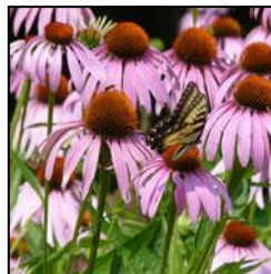
Purple Coneflower (Echinacea

grandiflorus ): Hardiness Zone 3-9, perennial, drought tolerant, low water, dry average soil, 1 ft tall, 1 ft spread, full sun mature plants may cover up to 1 sq ft per plant