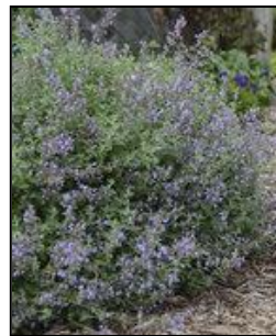
Catmint (Nepeta cataria):

tuberosa): Hardiness Zone 3-9, perennial, drought tolerant, 2-4 ft tall, 2-3 ft spread, full sun mature plants may cover up to 7 sq ft per plant