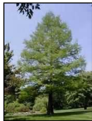
Bald Cypress ( Taxodium distichum ):

Hardiness Zone 4-7, medium growth rate, evergreen, heat/drought tolerant, alkaline soil, 60 ft tall, 20-40 ft spread, full sun