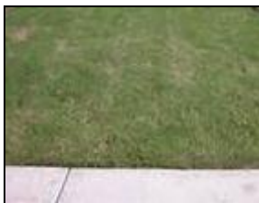
Buffalo Grass ( Buchloe dactyloides ): Warm season grass, drought resistant, low water, full sun