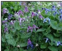
Mongolian Bells (Clematis integrifolia):

Hardiness Zone 5-8, perennial, dry to medium soil moisture, unknown soil type, 1-3 ft tall, 1 ft spread, full sun mature plants may cover up to 1 sq ft per plant