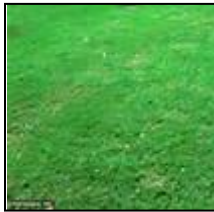
Bermuda Grass ( Cynodon dactylon ): Warm season grass, drought resistant, low water, full sun