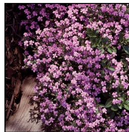
Soapwort ( Saponaria

( Scutellaria resinosa ): Hardiness Zone 6-9, perennial, drought tolerant, low water, average soil, 8-12 in tall, 1 ft spread, full sun mature plants may cover up to 1 sq ft per plant