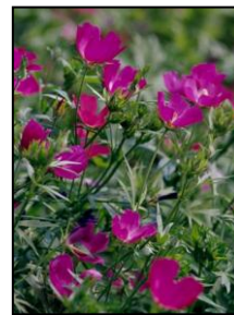
Poppy Mallow (Callirhoe

( Penstemon pinifolius Compactum ): Hardiness Zone 3-9, low water usage, well-drained soil, 1-6 ft tall, 1-2 ft spread, full/part sun mature plants may cover up to 3 sq ft per plant