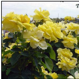
Grandma's Yellow Rose

Hardiness Zone 5-9, perennial, moderate water, well-drained soil, 3-4 ft tall, 3-4 ft spread, full sun mature plants may cover up to 12 sq ft per plant