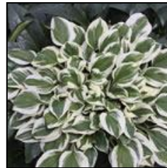
Diamonds are Forever ( Hosta ): Hardiness Zone 4-9, perennial, moderate watering, 8-12 in tall, 1-2 ft spread, shade/part shade mature plants may cover up to 3 sq ft per plant