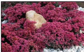
Dazzleberry ( Sedum dazzeberry ): Hardiness Zone 4-9, drought tolerant, average soil, 6-8 in tall, 18 in spread, full sun mature plants may cover up to 2 sq ft per plant