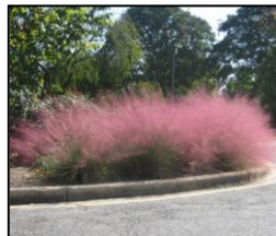
Pink Flamingo Muhly Grass ( Muhlenbergia pink flamingo ): Hardiness Zone 6-10, Grass, low water, heat loving, 4-5 ft tall, 1-2 ft spread, full sun mature plants may cover up to 3 sq ft per plant