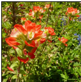
Indian Paintbrush (Castilleja

Ballerina Ruffles): Hardiness Zone 4-9, winter/early spring blooming, perennials, moderate watering, 1-2 ft tall, 2 ft spread, shade/part shade mature plants may cover up to 3 sq ft per plant