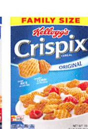
Crispix 12 oz., 18 oz.