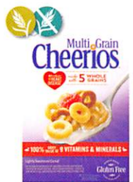
Multi-Grain Cheerios 12 oz., 18 oz.