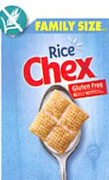
Rice Chex 12 oz., 18 oz.