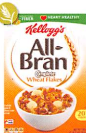
All-Bran Complete Wheat Flakes 18 oz.