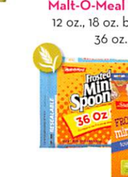
Mini Spooners Frosted 18 oz. box and bag, 36 oz. bag