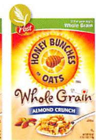
Honey Bunches of Oats Almond Crunch 18 oz.