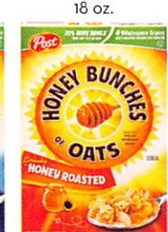
Honey Bunches of Oats Honey Roasted 18 oz.