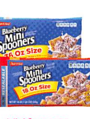
Mini Spooners Blueberry 18 oz., 36 oz. bag