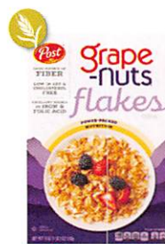
Grape-Nuts Flakes 18 oz.