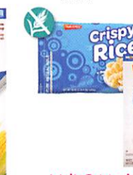
Malt-O-Meal Crispy Rice 12 oz., 18 oz. box and bag 36 oz. bag