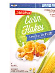
Malt-O-Meal Corn Flakes 18 oz.