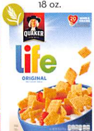
Life Original 18 oz.