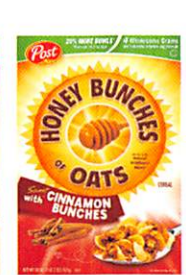
Honey Bunches of Oats Cinnamon Bunches 18 oz.