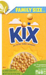
KIX 12 oz., 18 oz.