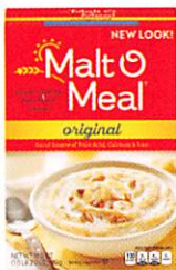
Malt-O-Meal Original 18 oz., 36 oz.