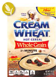
Whole Grain Cream of Wheat 18 oz.