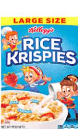
Rice Krispies 12 oz., 18 oz.