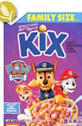
Berry Berry KIX 18 oz.