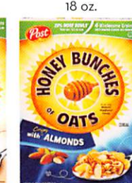
Honey Bunches of Oats with Almonds 18 oz.