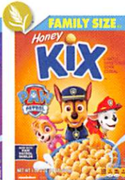
Honey KIX 18 oz.