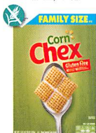
Corn Chex 12 oz., 18 oz.