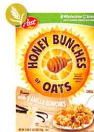
Honey Bunches of Oats Vanilla Bunches 18 oz.