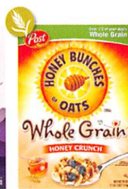
Honey Bunches of Oats Honey Crunch 18 oz.