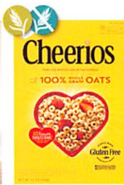
Cheerios 12 oz., 18 oz., 36 oz.