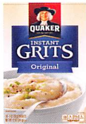
Instant Grits Original 12 oz., 18 oz., 36 oz.