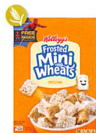
Frosted Mini Wheats 18 oz., 36 oz.