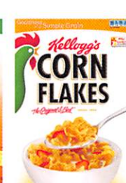
Corn Flakes 12 oz., 18 oz., 36 oz.