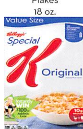
Special K Original 12 oz., 18 oz.