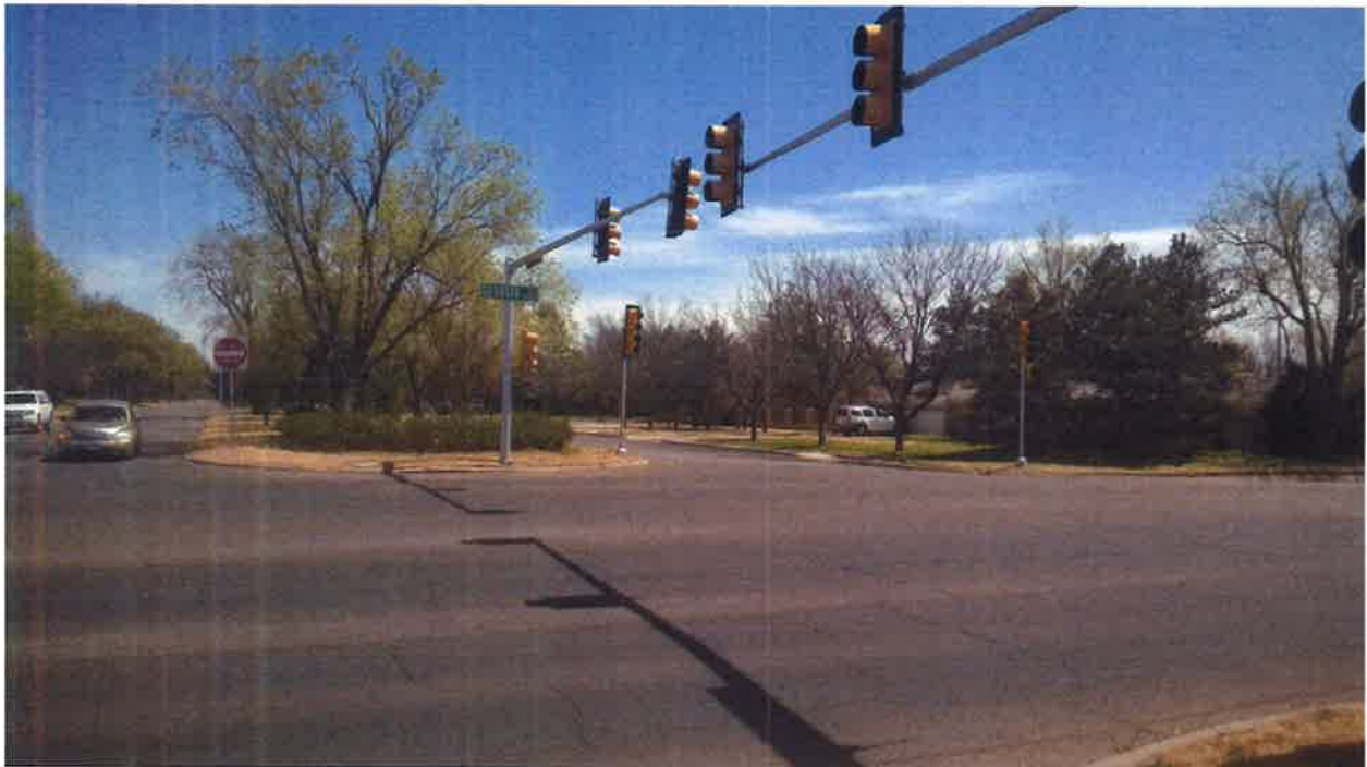
Looking southeast down Julian Blvd from the S Georgia St intersection (Area zoned R-1).