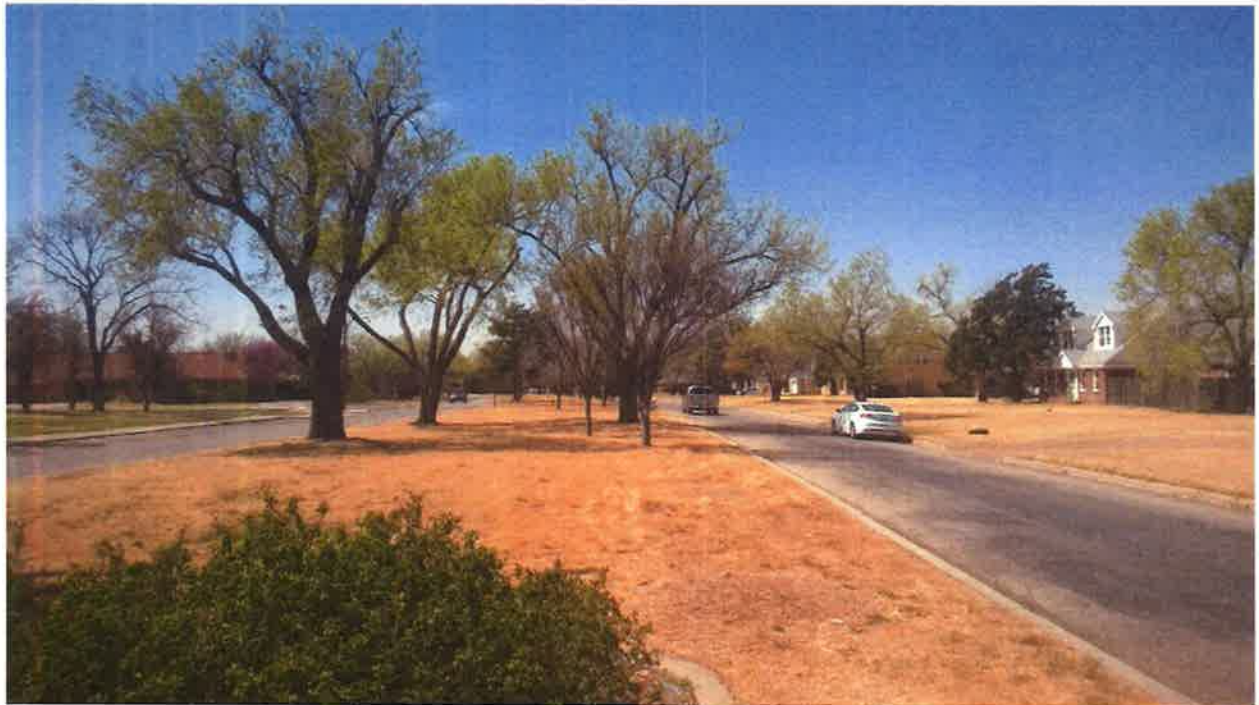
Looking west from the median of Julian Blvd (Areas zoned R-1).