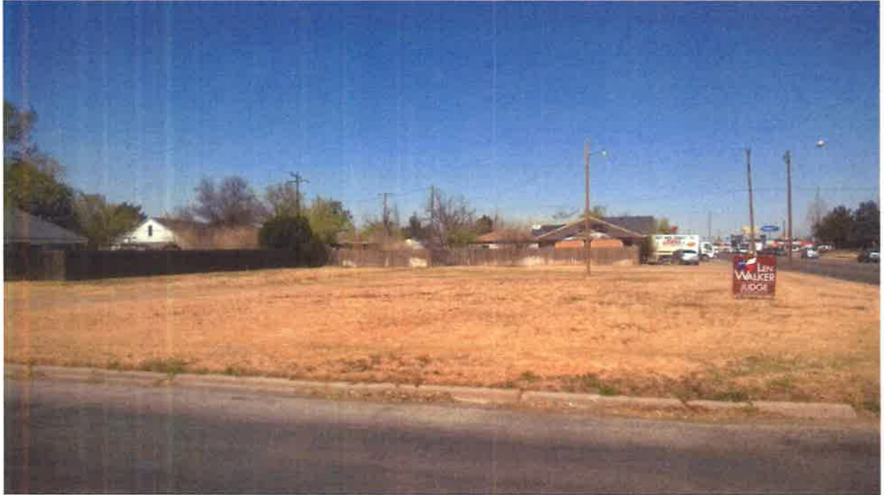
Looking northwest at the property for consideration from Julian Blvd (Currently zoned PD-315)/