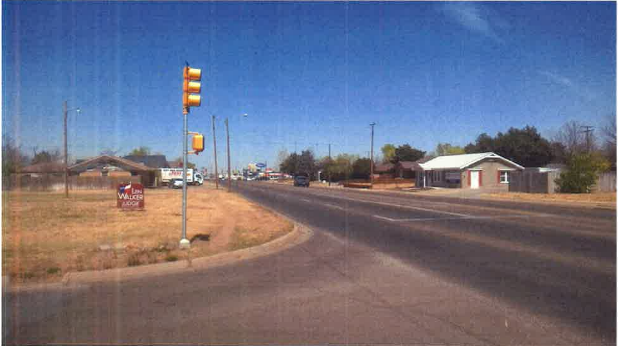
Looking northeast up S Georgia St from the Julian Blvd median (Insurance agent office seen right zoned PD-232 with subject property on your left)