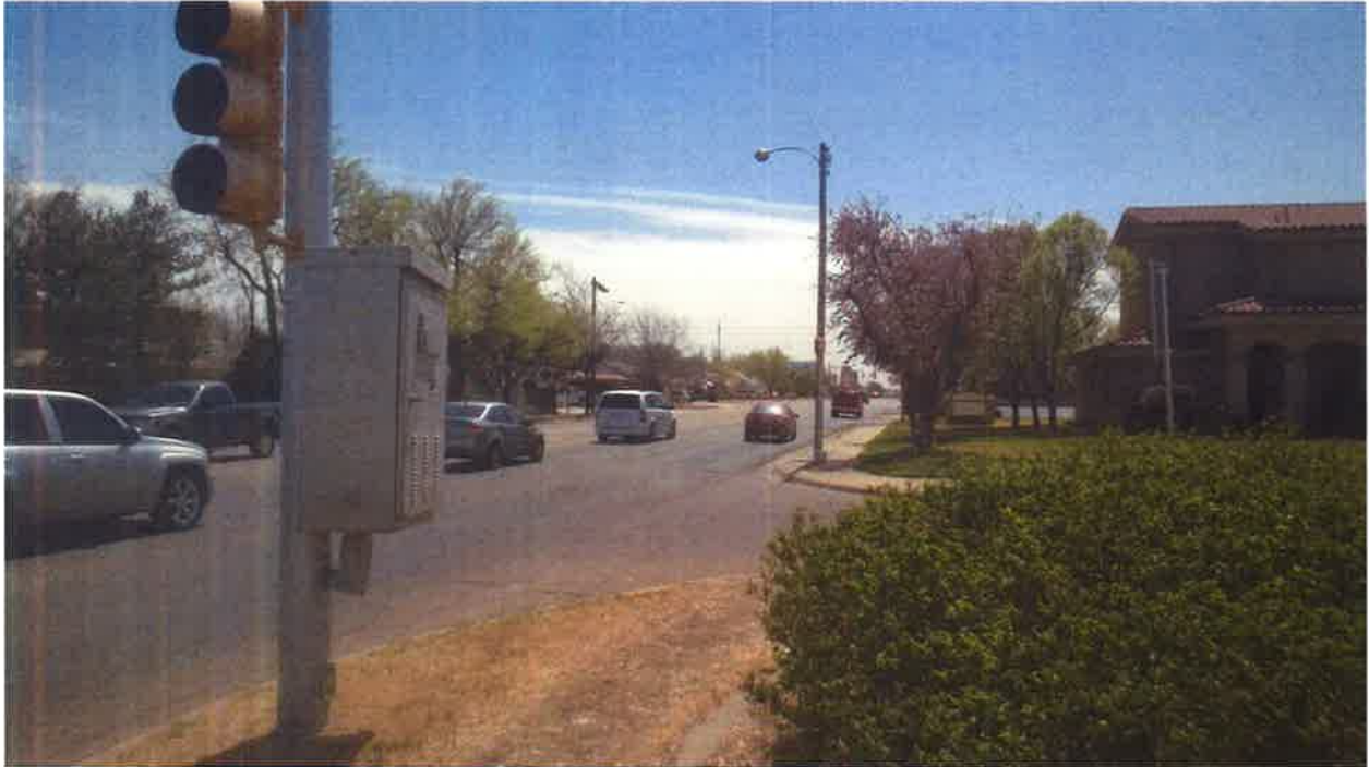
Looking south down South Georgia Street from the Julian Blvd median (Church seen on right).